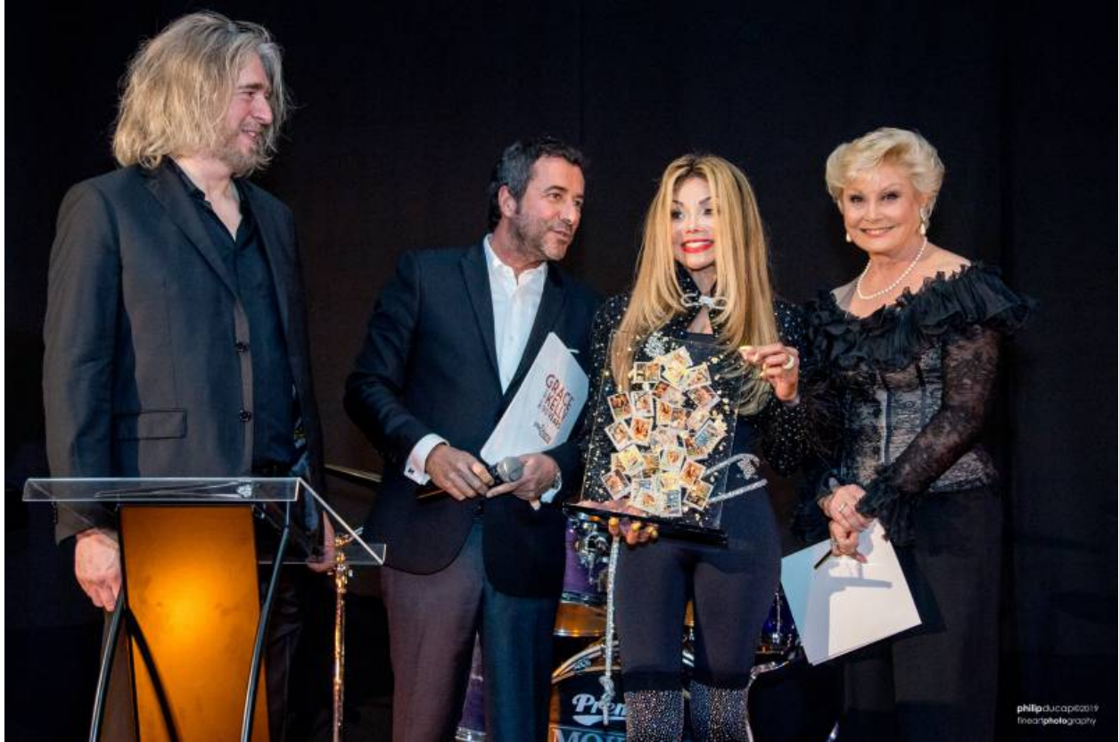
La Toya Jackson being awarded at the opening of "Grace Kelly, 90 years" exclusive exhibition (Car Collection of H.S.H. the Prince of Monaco, 18th April 2019).