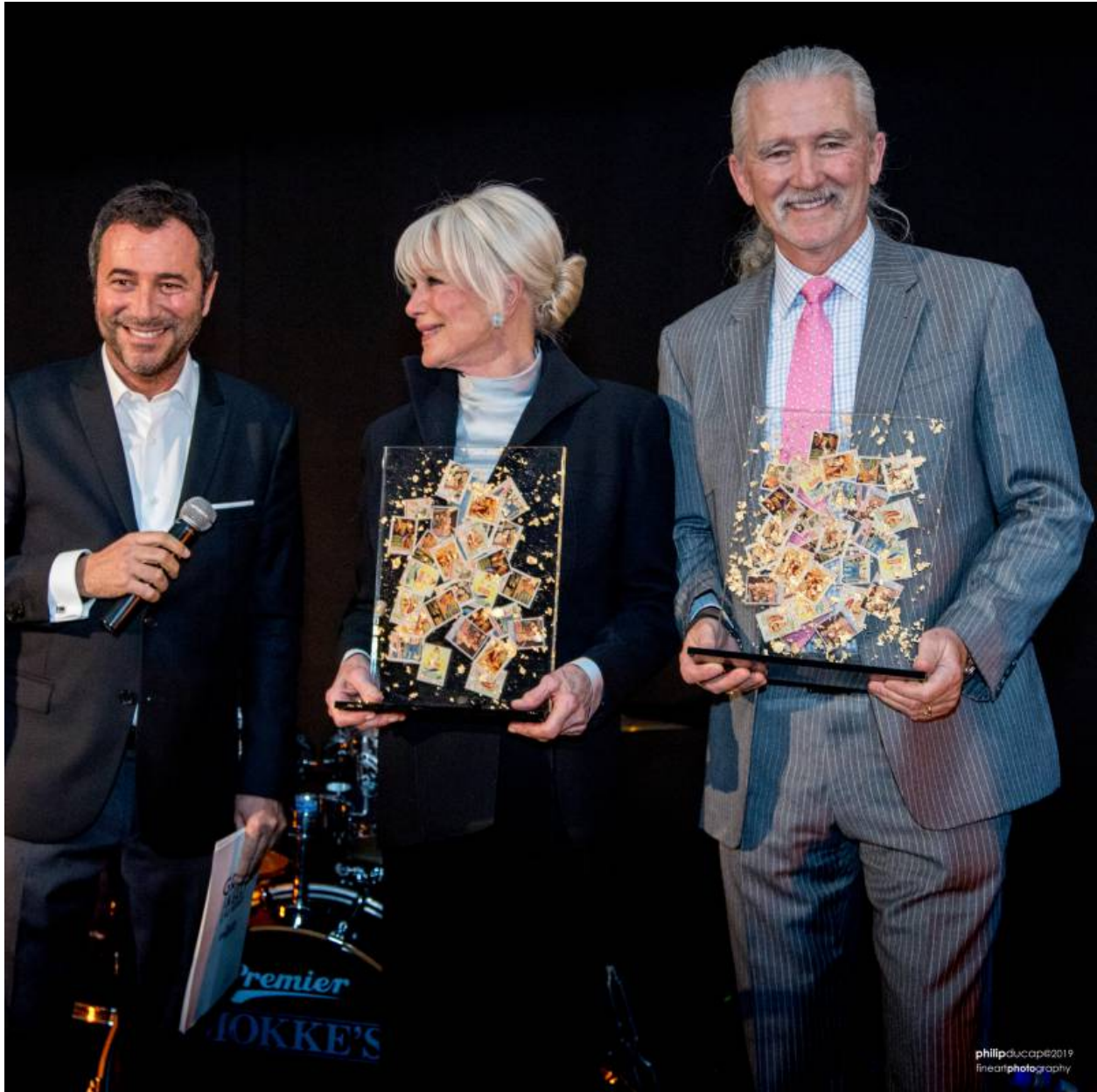
Linda Evans and Patrick Duffy being awarded at the opening of "Grace Kelly, 90 years" exclusive exhibition (Car Collection of H.S.H. the Prince of Monaco, 18th April 2019).